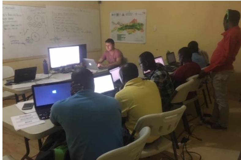
People I was teaching to simulate existing water systems using EPANET

I did not receive much training after I arrived, but the skills I acquired from my MSc in Community Water and Sanitation helped me tremendously. While in Haiti, I used both the skills from my MSc and my undergraduate engineering skills throughout the duration of my project.