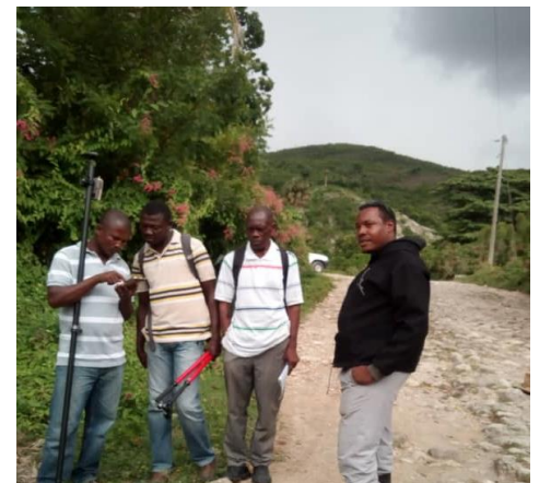
Haiti Outreach staff training local water officials in mapping procedure